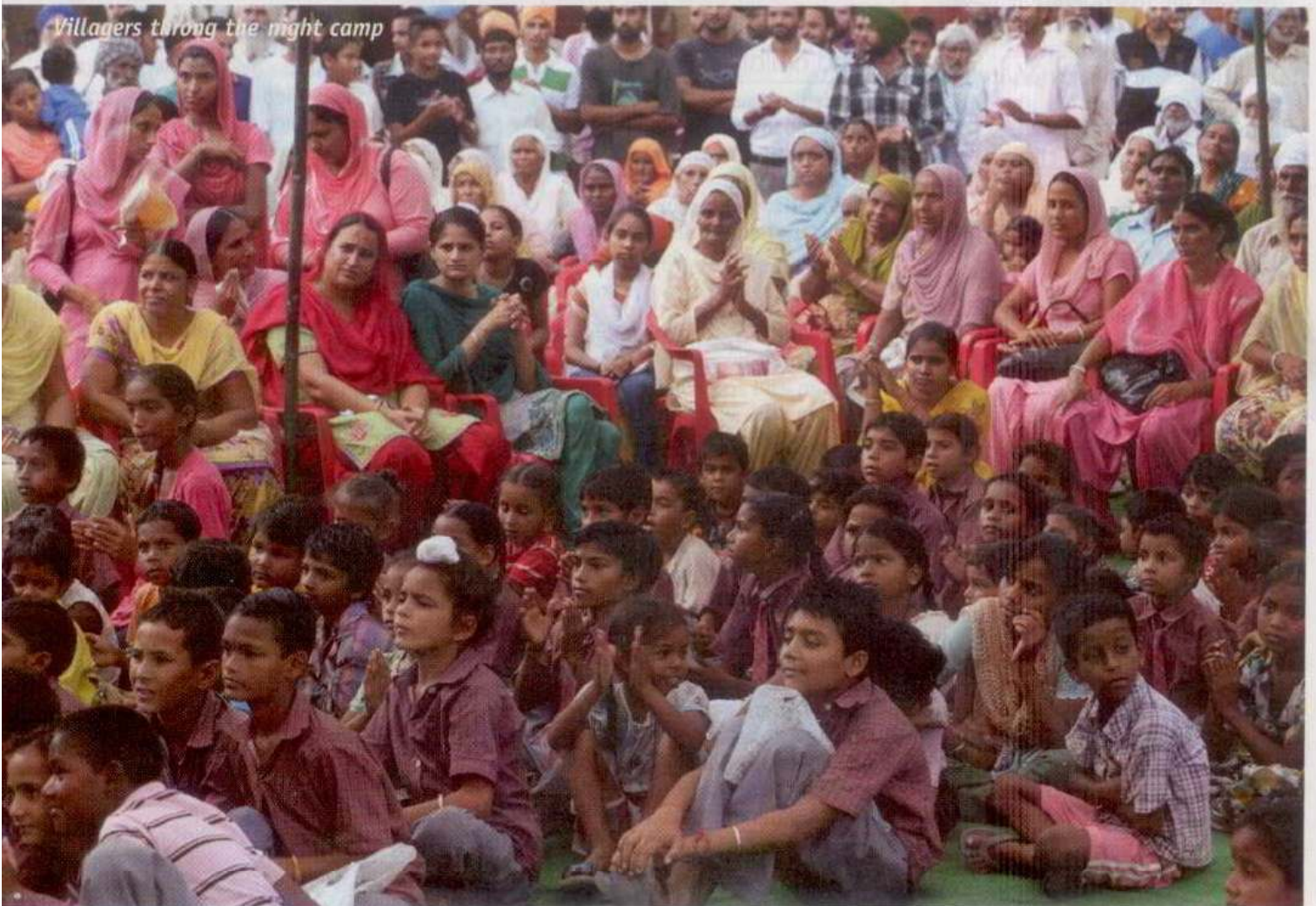
Villagers through the night camp

The night camps are enjoying full support of people and they are participating whole-heartedly in them as their issues are addressed and resolved on the spot. No wonder this unique concept of the state government is fast catching up with people. ■